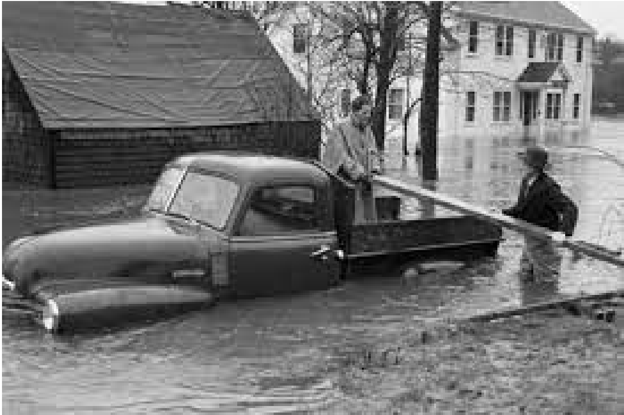
Union Street Bedford 1956