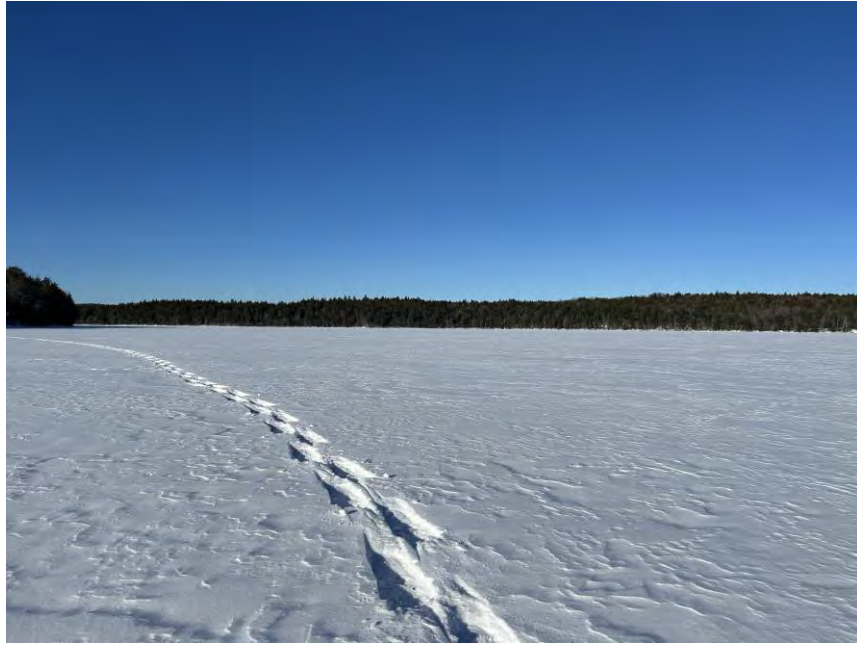
Sandy Lake

Hello Sandy Lake-Sackville River Coalition member groups. Please share this February 7, 2026 newsletter with your membership.