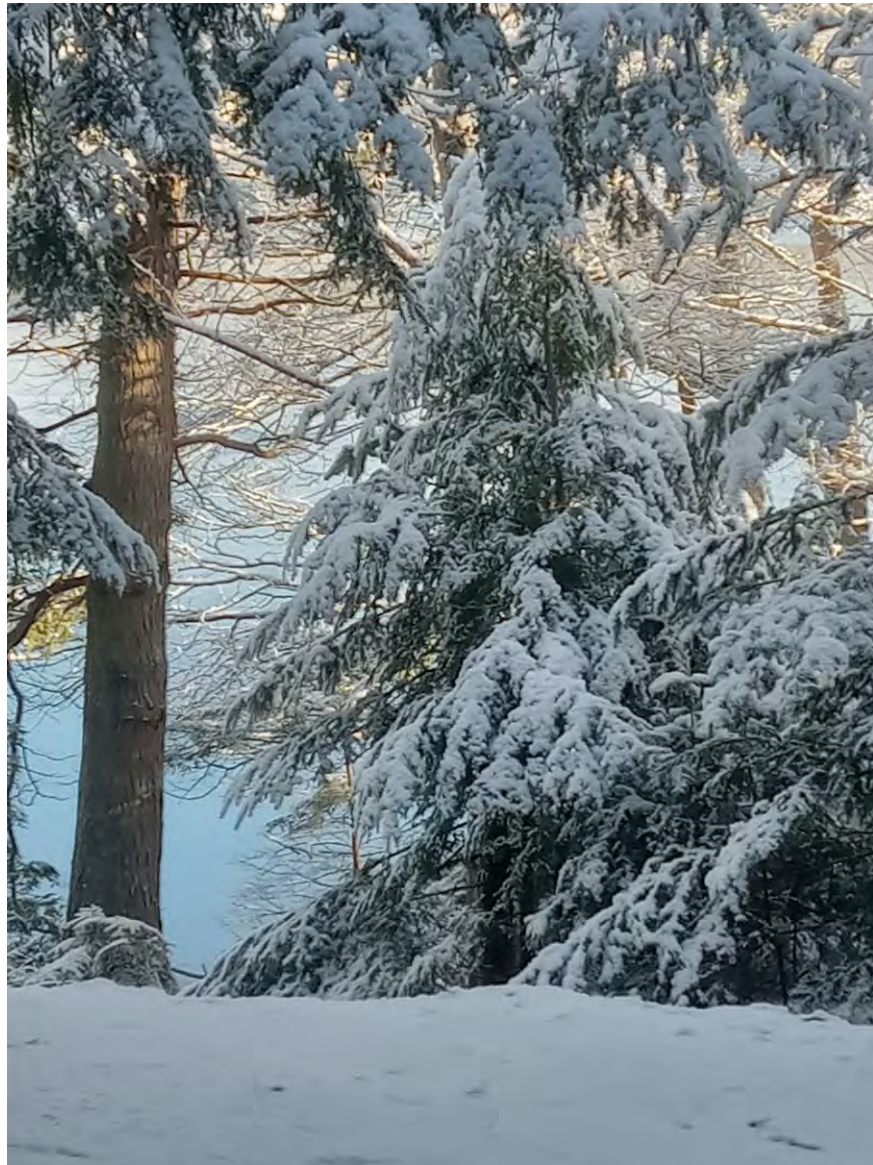
Sandy Lake